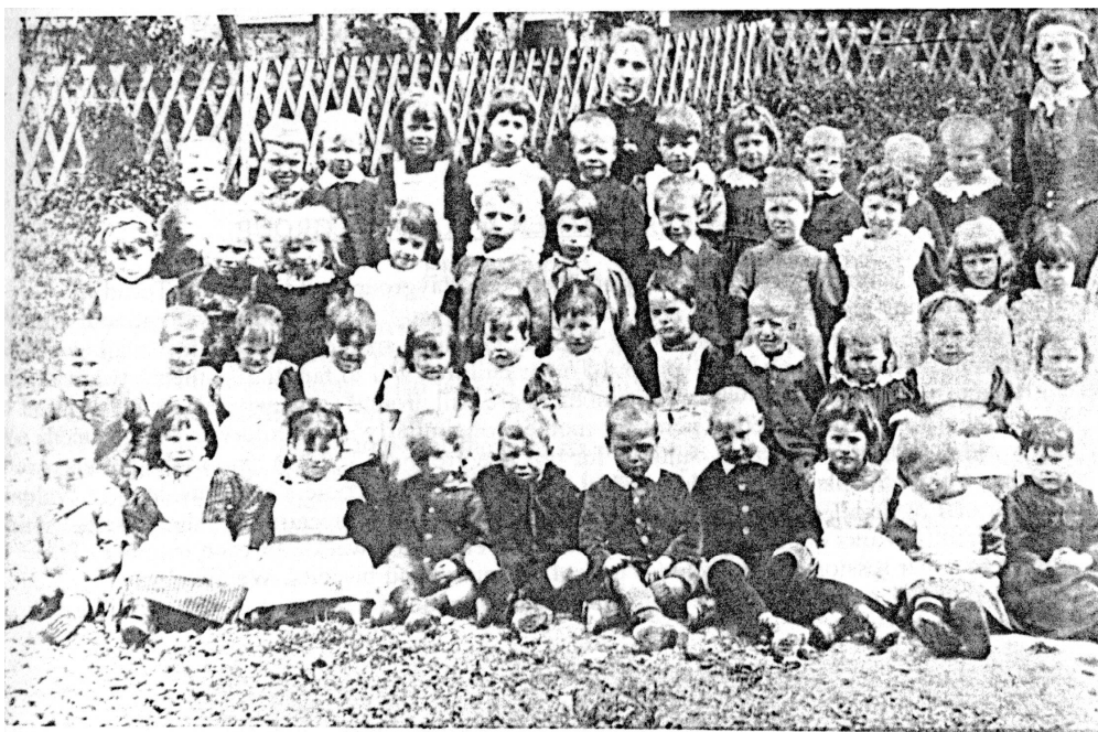
THE LOWER DIVISION OF ELSWORTH SCHOOL IN 1896

The quotations are from the Elsworth School Log Books 1887-1901.