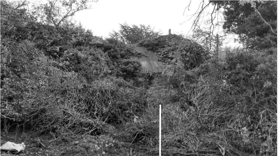
THE BUTCHER'S SHOP AS AT NOVEMBER 2021