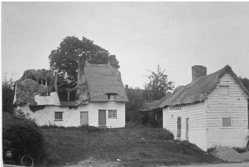
THE OLD BUTCHER'S SHOP (on right of cottage)