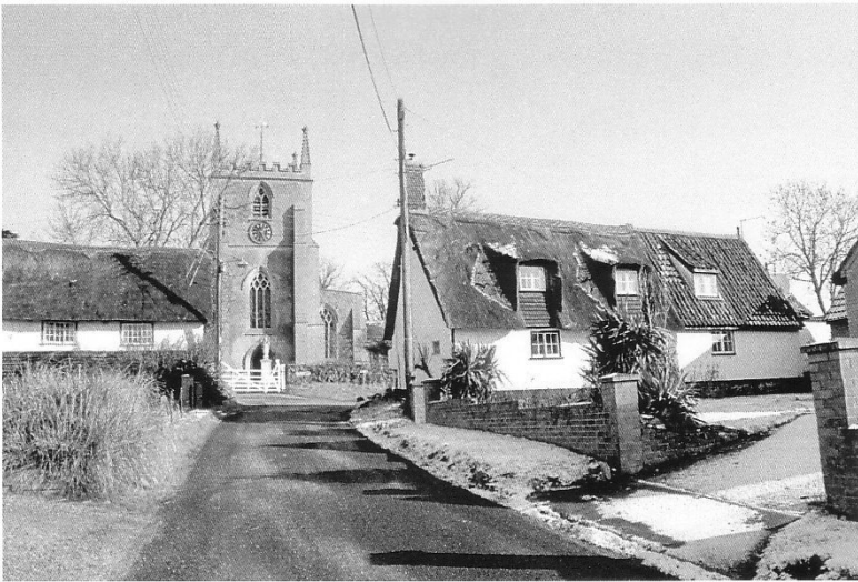
Holy Trinity Church