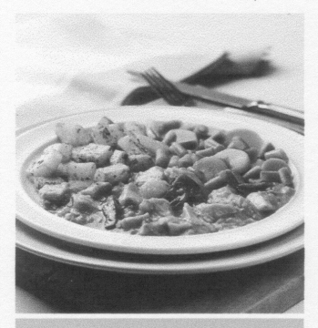
Chicken & Vegetable Casserole £2.95

The solution is a delicious Wiltshire Farm Foods meal, ready and waiting in your freezer.